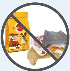
Plastic and Pet Food Bags