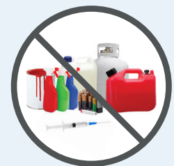
Medical and Household Hazardous Waste