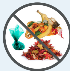
Food, Yard, and Pet Waste